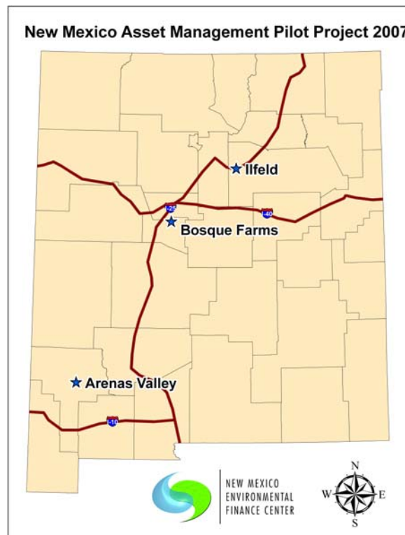
Map 1 – Vicinity Map

The NMEFC was tasked with developing an asset management manual for water and wastewater systems, with a focus on the needs of smaller systems. In addition the NMEFC was tasked with piloting the approach for three communities. The three systems that were selected were Arenas Valley Water Development Association, Bosque Farms Water Supply System, and Ilfeld Mutual Domestic Water Consumers Association. The three water systems were selected based on their relative size, number of connections, and location throughout the state. Map 1 is a vicinity map showing the location of the three systems that were the focus of the case studies.